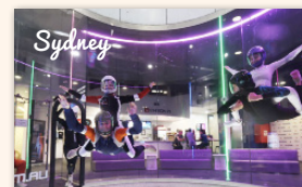
iFLY Downunder Indoor Skydiving 330 booked ★★★★★