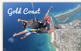
Beach Landing Tandem Skydive 880 booked ★★★★★