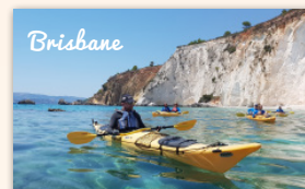
Riverlife Adventure Brisbane 340 booked ★★★★★