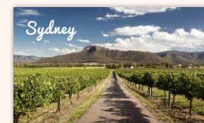
Hunter Valley Boutique Wine Tour 880 booked ★★★★★