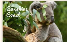
Australia Zoo Admission 863 booked ★★★★★