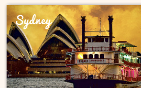
The Showboat Classic Dinner Cruise 498 booked ★★★★★