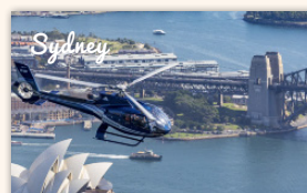
Helicopter Flight over Harbour 536 booked ★★★★★