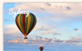
Hot Air Balloon Sunrise Flight 890 booked ★★★★★