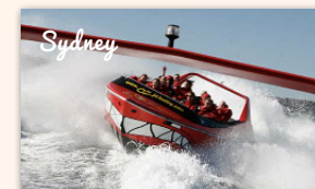
Sydney Harbour Oz Jet Boating Shark Attack Thrill Ride 650 booked ★★★★★