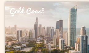
Gold Coast Nature & Wildlife Tour 550 booked ★★★★★