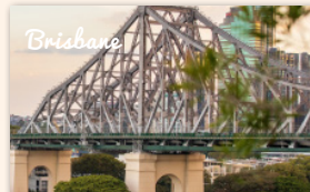
Story Bridge Adventure Climb 650 booked ★★★★★